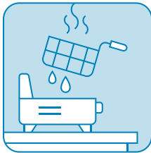
Used Cooking Oil

Ultra Low Carbon Intensity (CI) Feedstocks: